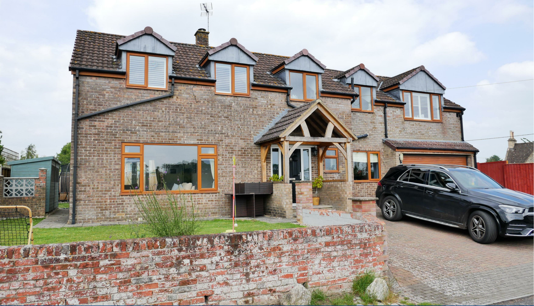
The Close, Calne £850,000